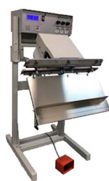
Industrial Vacuum Sealer