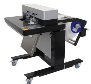
Auto bag R3200 Automatic Bagger