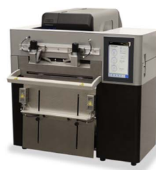
Auto bag R785 Fulfilment Bagger