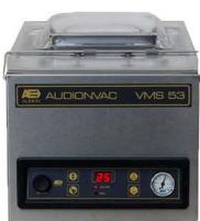
Chamber Vacuum Sealer