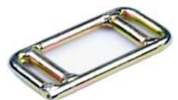
Forged Metal Buckles