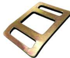
Flat Stamped Metal Buckles