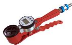
MegaFlow Venturi System